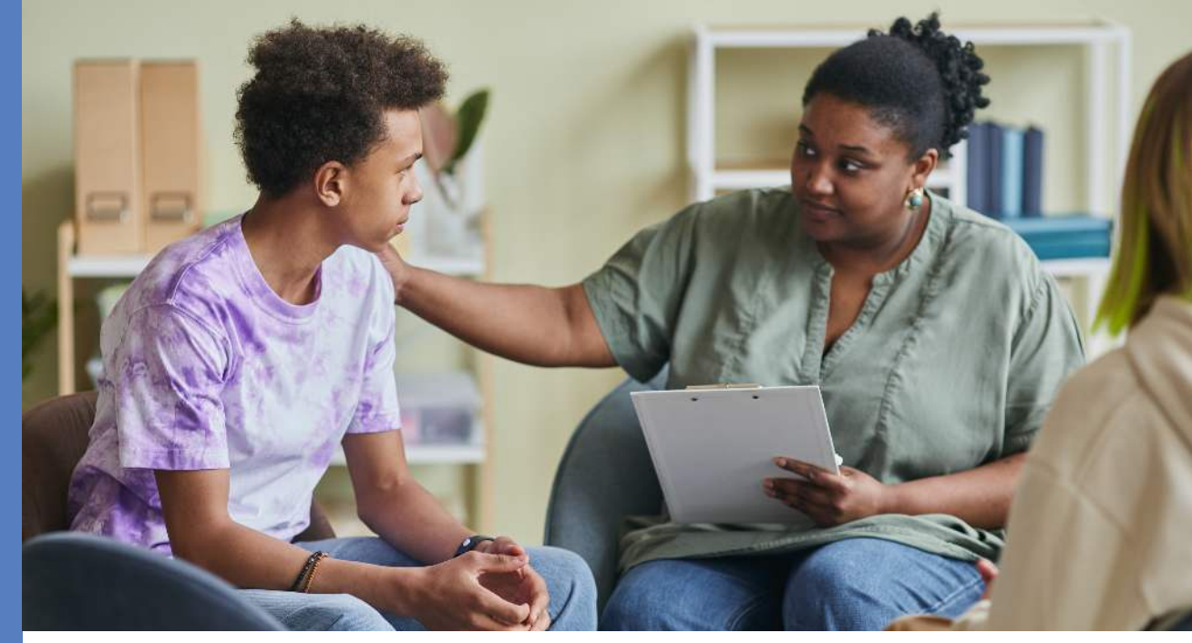
A scheduled appointment is a commitment of time between you and our teams. We have reserved that time just for you.

When appointments are missed or canceled, that time is permanently lost and other consumers that could benefit from that time lose the opportunity to receive care.